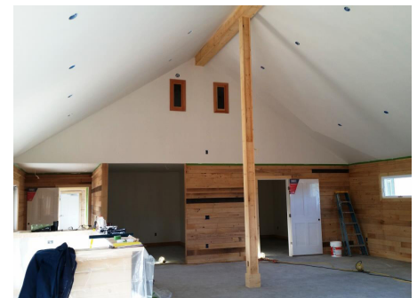
Interior of the new Hancock Historical Society Building