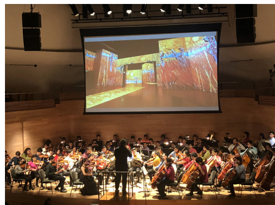
The Jalapa Youth Orchestra in the smaller concert hall at the 'Tlaqná Center'