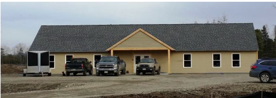
New Hancock Historical Society Building